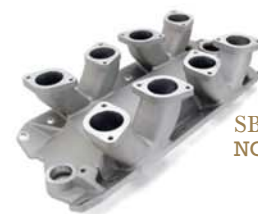
SBC, IDA NG1919

* Gaskets are also available for each manifold type.