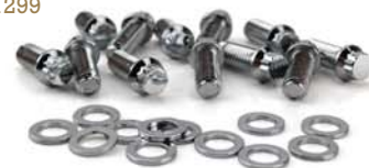
SBC Chrome Bolt Kit NG1299