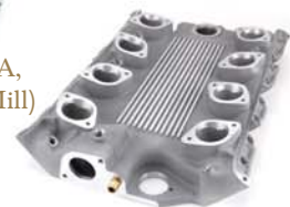
390/427/428 FE, IDA, 48mm, (10° Angle Mill) NG1918