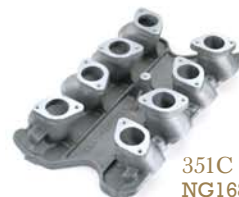
351C Pantera, IDA 4V NG1689