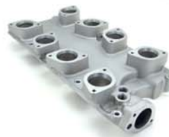
289-302, IDA NG1692