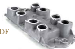
BBC, Oval Port, IDF NG1676